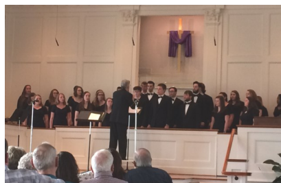
ARBC hosted a concert by the North Greenville University Choir on April 2nd